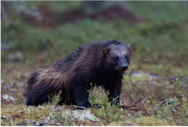
Wolverine