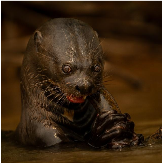
Giant river otter