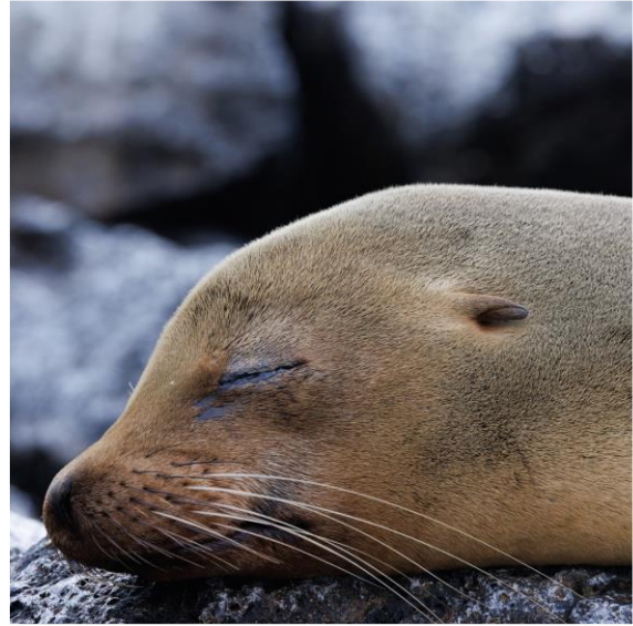
Galapagos fur seal