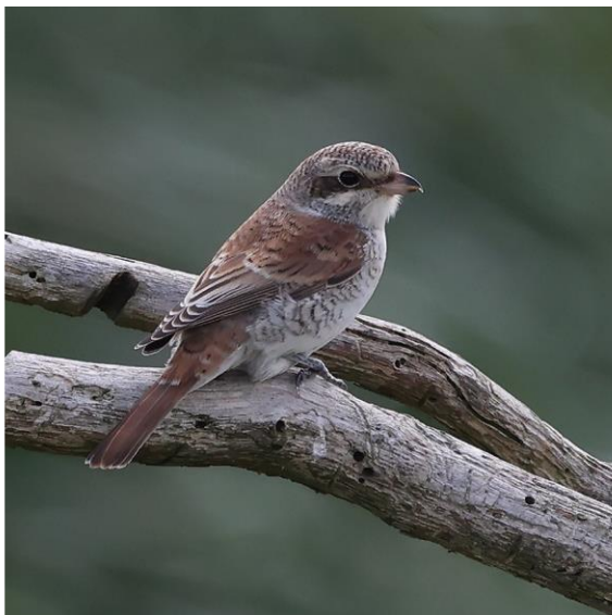
Juvenile red-backed shrike