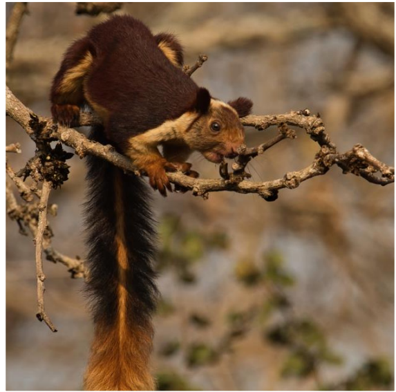
Malabar giant Squirrel