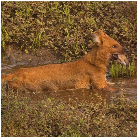
Indian wild dog