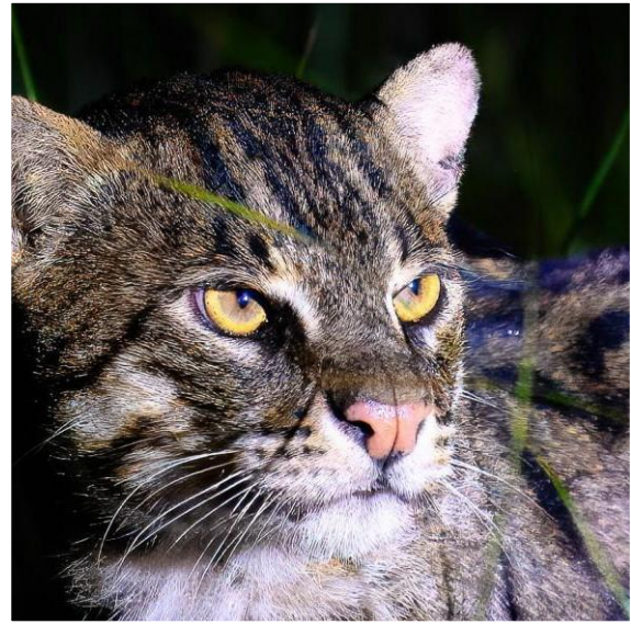
Fishing cat