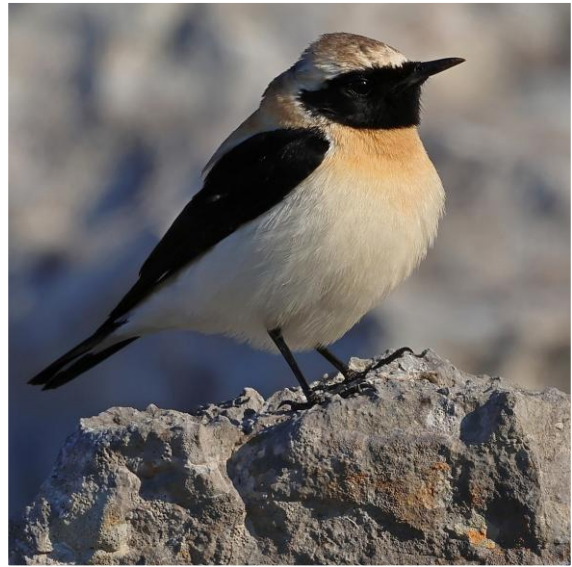
Eastern black-eared wheatear