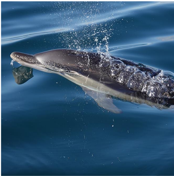
Short-beaked common dolphin