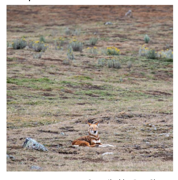
Compiled by Ben Cherry