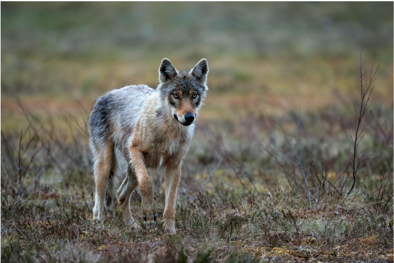
Grey wolf 'Scruffy' by Bret Charman