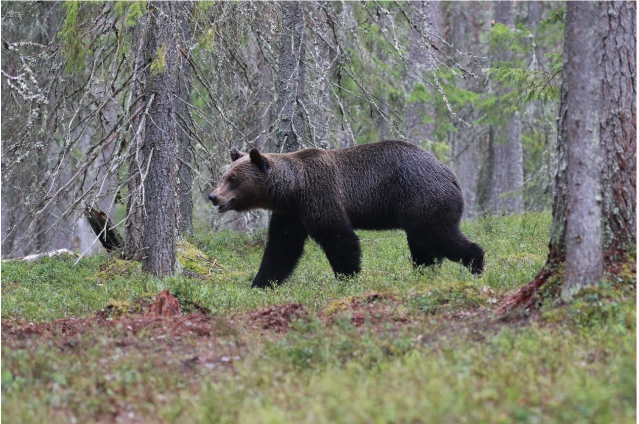
Brown bear