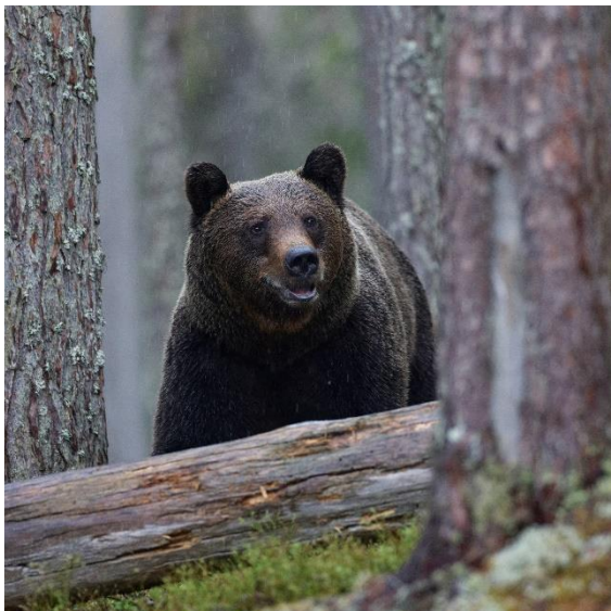
Brown bear