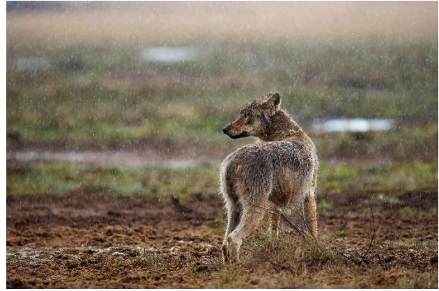
Wolf in the rain by Bret Charman

Meanwhile, at Forest, they were treated to fantastic views of a bear (so all the members of the group were finally rewarded with sightings of a bear). As well as the excellent views of the bear, the clients at Forest were enjoying the red squirrels as they moved around the landscape. However, the undoubted highlight was a couple of visits from at least two different wolverines. The wolverine is the largest member of the mustelid family – think giant badger which is seemingly unable to stay still for more than a second.