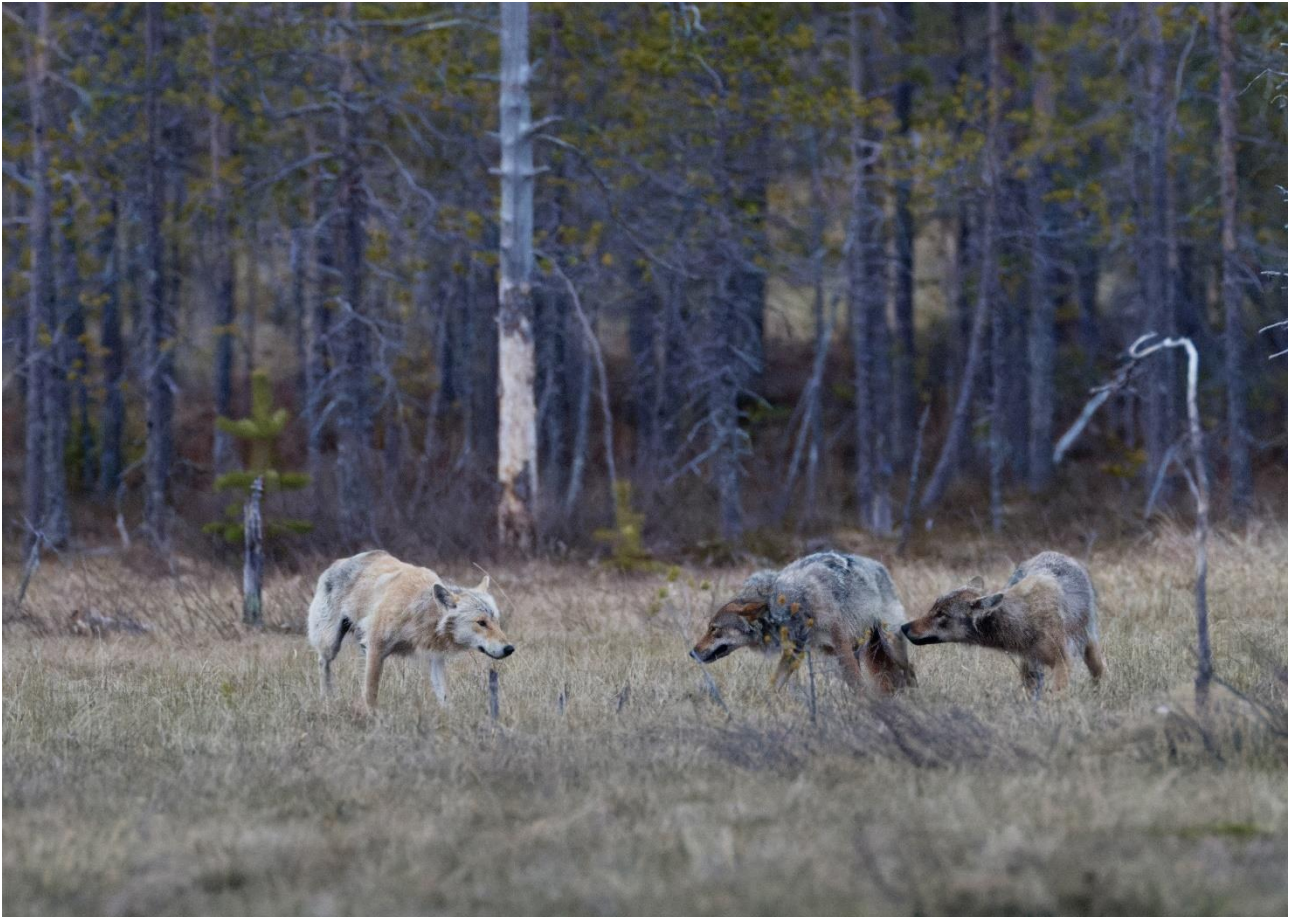
Grey wolf pack by Kevin A

With just over an hour to go in the hides, he was back for one last check of the site, before disappearing off into the great expanse of the forest once more.