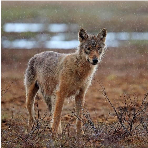
Grey wolf