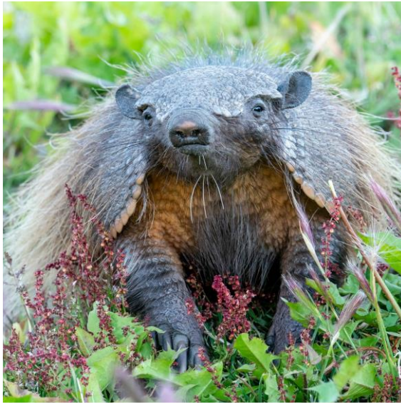
Large hairy armadillo