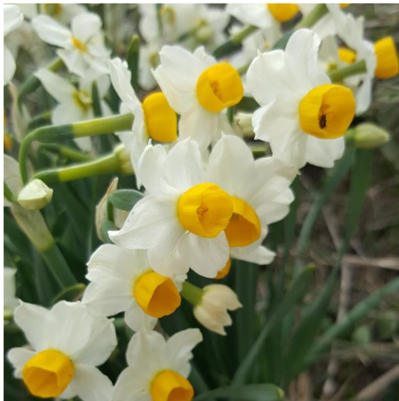
Narcissus tazetta - Spili