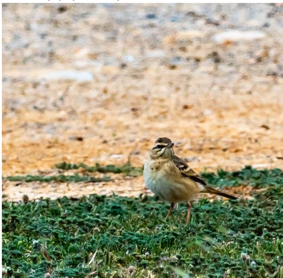
Tawny pipit - Aposelemis marsh