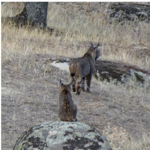
Iberian lynx cub & male