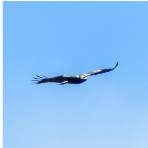
Spanish imperial eagle