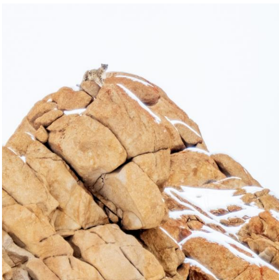
Snow leopard