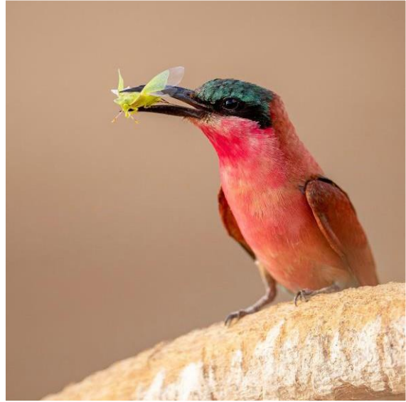
Southern carmine bee-eater