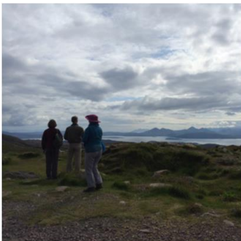
From Bealach na Ba looking across to Skye