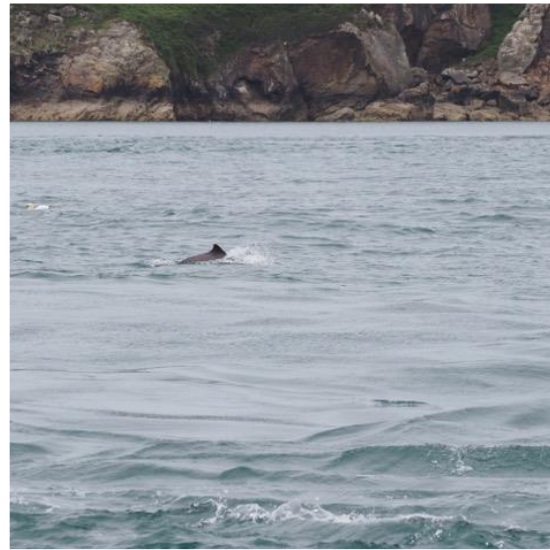
Harbour porpoise - Ramsey Sound