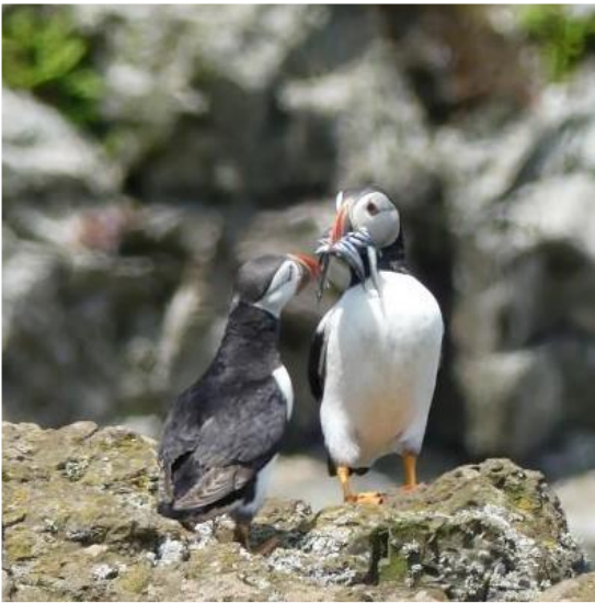
Atlantic puffin - Skomer